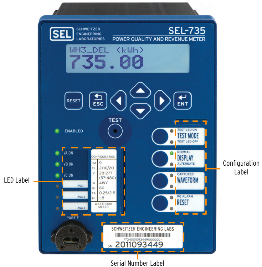
Figure 2 Typical SEL-735 Configurable Label Areas (Vertical)

The SEL-735 features a versatile front panel that you can customize for your needs. Use SELOGIC ® control equations and slide-in, configurable front-panel labels to change the function and identification of target LEDs and operator control pushbuttons and LEDs.