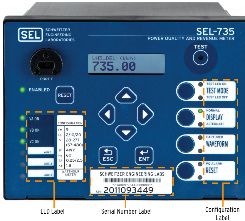
Figure 1 Typical SEL-735 Configurable Label Areas (Horizontal)

The SEL-735 Configurable Labels Kit provides the materials and information needed to customize the LED, serial number, and operator control pushbutton areas of the front panel. Figure 1 shows the pocket areas.