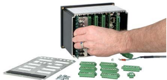
The SEL-2411P makes exchanging or expanding I/O cards easy. Just detach the connectors and remove the rear cover.