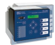
Vibration (15 g Shock)