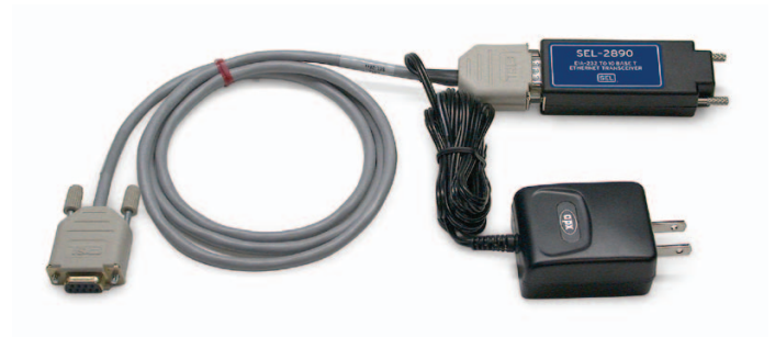
Use the SEL-C642 Configuration Cable to provide power to the SEL-2890 when used with a PC or other ac-powered device.

If a power system fault occurs, set the transceiver to send email, including the fault type and location. Send SEL relay automatic messages to a specified address for quick notification and logging.