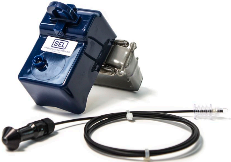
SEL-ARU with integral LED and remote fiber-optic display.

The optional SEL-ARU with a remote fiber-optic display speeds up and simplifies retrofit applications, enabling utilities to upgrade to an FCI solution with a longer operational life than other FCIs on the market. The SEL solution works in pad-mounted distribution equipment with 5/16" fiber-optic display holes. The phase sensor has an integrated LED that will flash until current is restored or the timer expires. The optional fiber-optic cable includes a sealing washer for superior cabinet corrosion protection.