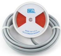
Large "L" Display (BEACON LED optional)