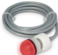
BEACON Bolt® display