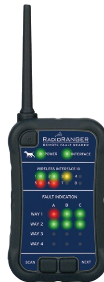
RadioRANGER® Remote Fault Reader (SEL-8310 Display)