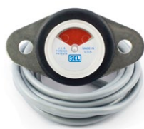
Standard "V" Display (BEACON LED optional)