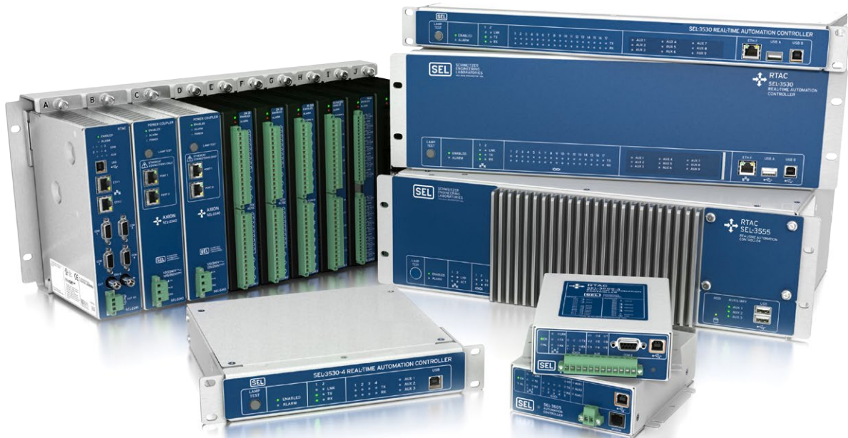
The SEL RTAC family.