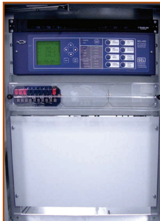
SEL-451 Relay, SEL-9321 Low-Voltage DC Power Supply, SEL-2401 Satellite-Synchronized Clock, fiber patch panel, FT-1 switch, fuses, heater, and terminal blocks in a dual-door cabinet.