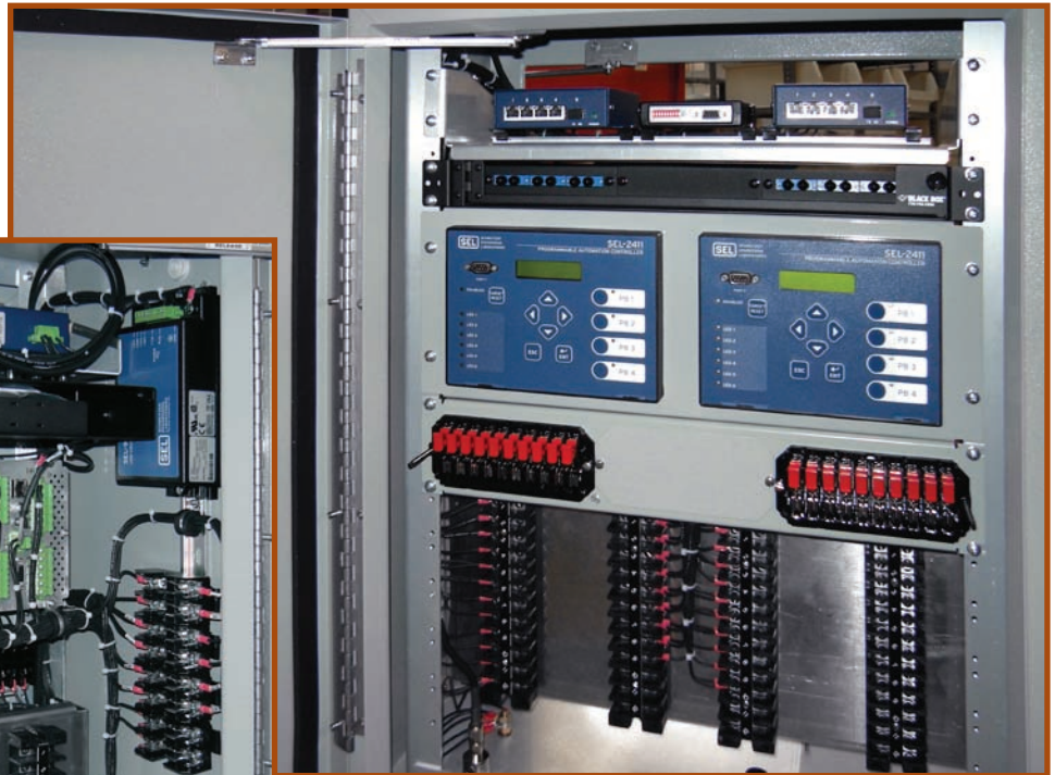
Two SEL-2411 Programmable Automation Controllers, two SEL-2725 Five-Port Ethernet Switches, SEL-9321 Low-Voltage DC Power Supply, SEL-2401 Satellite-Synchronized Clock, heater, fuses, terminal blocks, FT-1 switches, and a fiber patch panel in a dual-door cabinet.