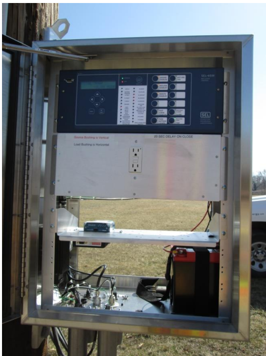
Figure 2—SEL-651R Advanced Recloser Control, SEL-2401 Satellite-Synchronized Clock, and 3G Cellular Modem

Cellular communications allowed Westar to minimize deployment times since there was no back-end infrastructure to build and maintain. Although there were ongoing data charges, data rate plans were negotiated with the cellular provider(s), which offset the costs that would have been associated with a company-owned system. Additionally, the cellular network is continually being built to incorporate new technologies with increasing data throughput rates and decreasing costs of data plans. With the development of new cellular chipsets coupled with embedded microprocessors, IED vendors are beginning to deploy IEDs with integrated cellular modems as an option, some which even harvest power from the very lines they are monitoring, thus minimizing installation time and costs. It is for these reasons that Westar is confident that the move to cellular was the correct decision.