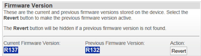
Figure 3 Firmware Versions

If you revert the firmware to a previous version, and then go through a firmware upgrade process, your device will inherit the settings that were on the unit immediately before the revert function was activated. Please be aware of this behavior before upgrading firmware if you have previously activated the revert function.